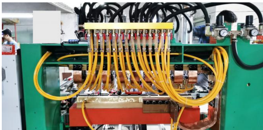
Principle of spot welding

4.The transparent water flow valve is customized in Taiwan. There are nearly 100 cylinder + solenoid valve actions of gantry welder, and dozens of water circulation. With this gadget, no matter which route has a problem, it is easy to find and see it safely,